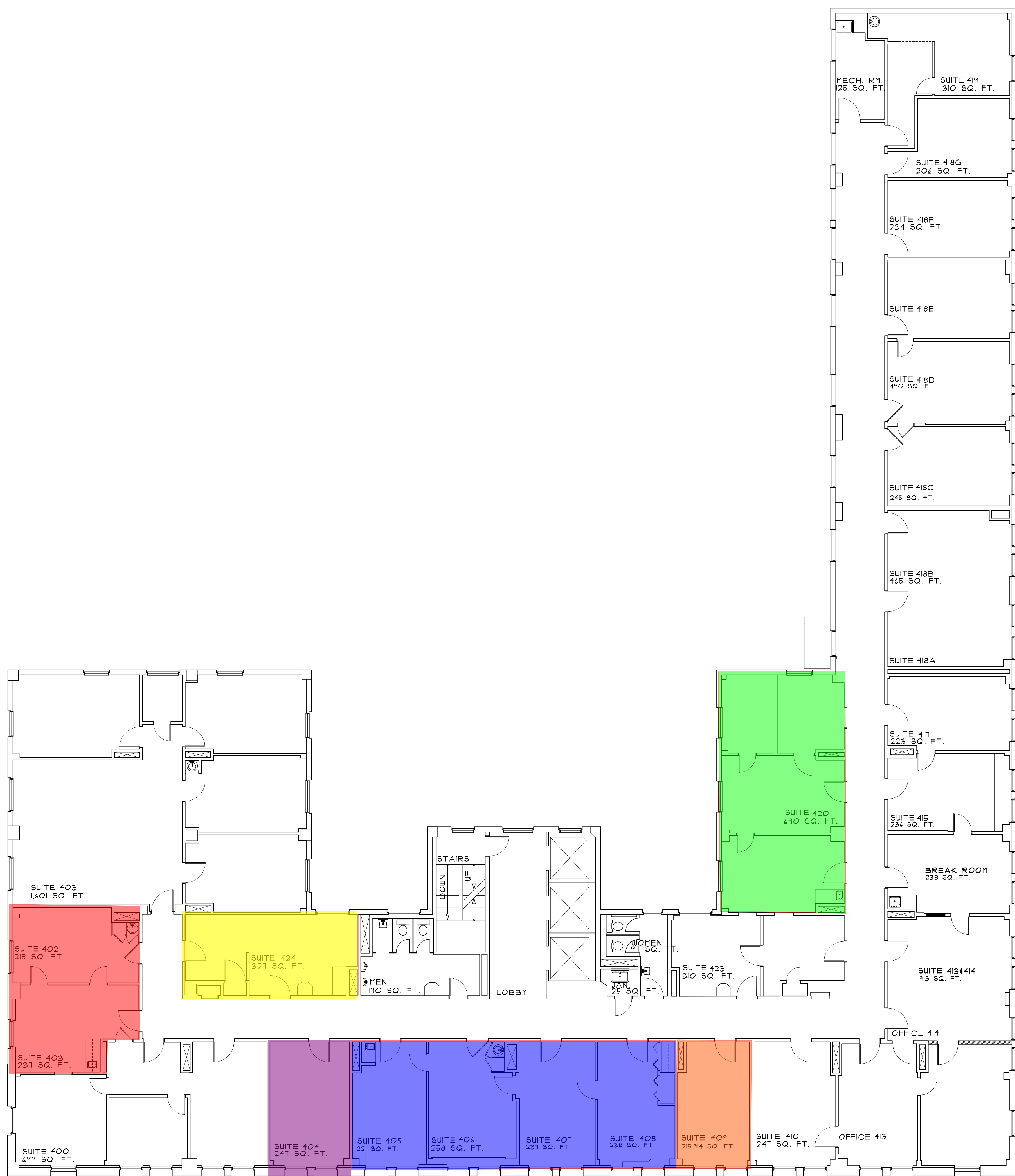
EXISTING FOURTH FLOOR PLAN

© 2005 COPYRIGHT JOHNSON ARCHITECTURE ALL RIGHTS RESERVED