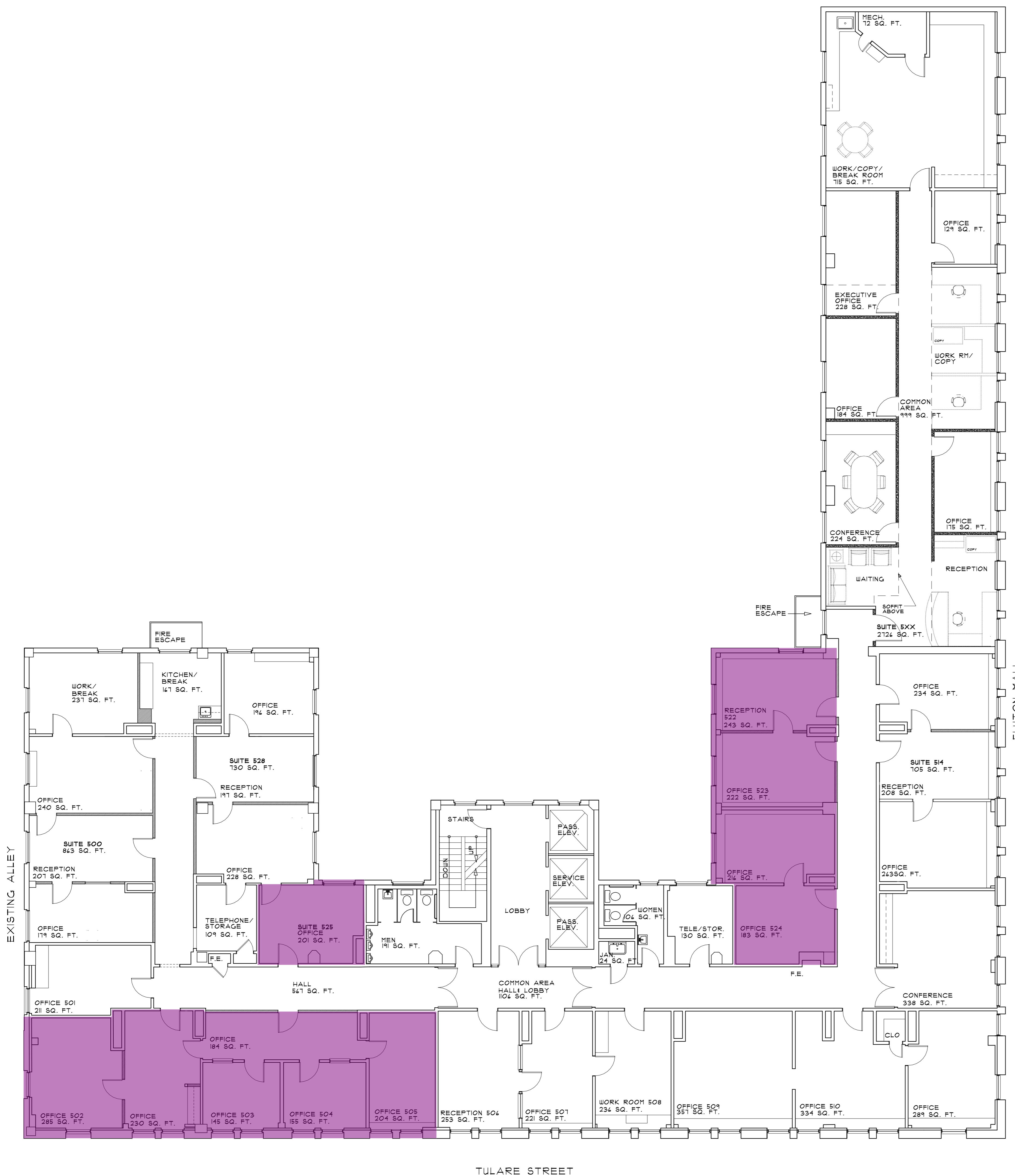
EXISTING FIFTH FLOOR PLAN

(ALL SQUARE FOOTAGES AMOUNTS ARE APPROXIMATED ESTIMATES)